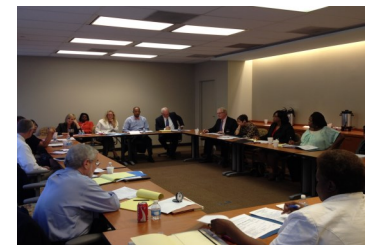
Memphis and Shelby County JDAI Governing Committee