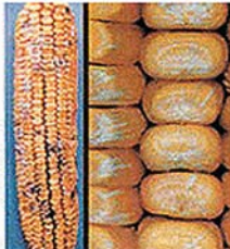
15. Fusarium moniliforme L. ear rot; R. white streaks under seed coat