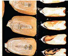
17. Blue eye ( Penicillium )