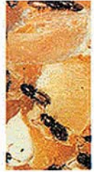
6. Flat grain beetle