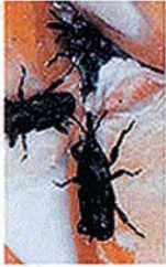
1. Rice weevil