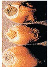
18. Split kernels with dock damage