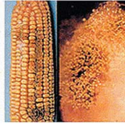
13. Aspergillus flavus L. ear rot; C. growing on a corn kernel; R. under a black light