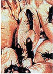
7. Sawtoothed grain