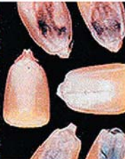
16. Fusarium (above), Penicillium (below)