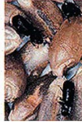
10. Lesser grain borer