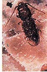
9. Rusty grain beetle