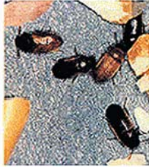
8. Hairy fungus beetle