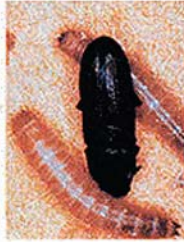
3. Confused flour beetle