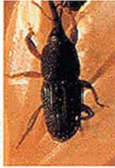
2. Granary weevil