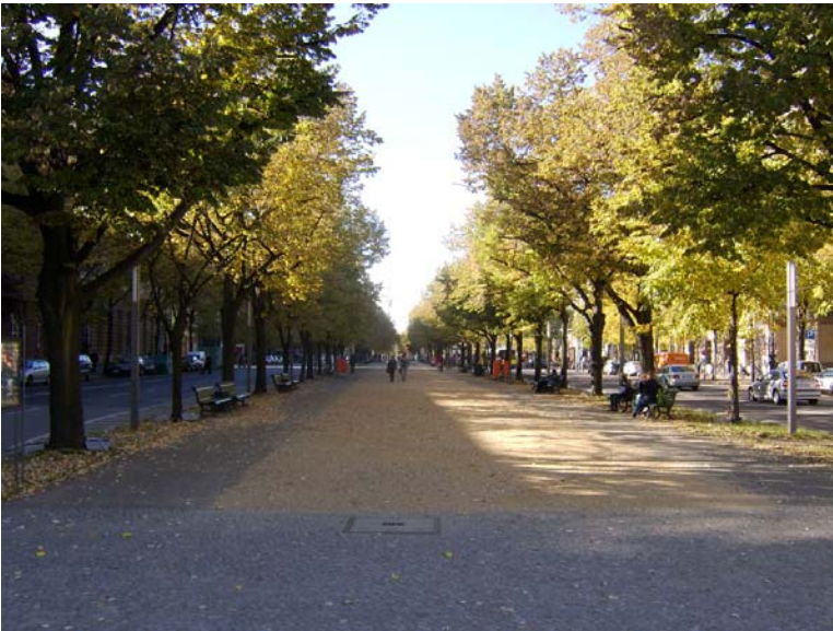
Unter den Linden, today

The Memphis City Council bases its resolution, in part, on the fact that there is no City street named in this City after Dr. Martin Luther King, Jr. Only a segment of Interstate 240 through Midtown and South Memphis currently bears his name. Council chose this segment of Linden due to its high profile nature near the FedEx Forum, its historical importance due to its proximity to Clayborn Temple and the fact that none of the abutting property owners contain Linden Avenue addresses. The last factor is important in that no businesses or residences will need to change their address due to this street name change request. Linden Avenue was not named after a family; rather, it was named after the boulevard, Unter den Linden (“Under the Linden Trees Blvd.”) in Berlin over which the Brandenburg Gate was built. Below are images of that street.