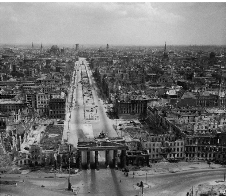
Unter den Linden at end of WWII.

RECOMMENDATION: Approval of the street name change.