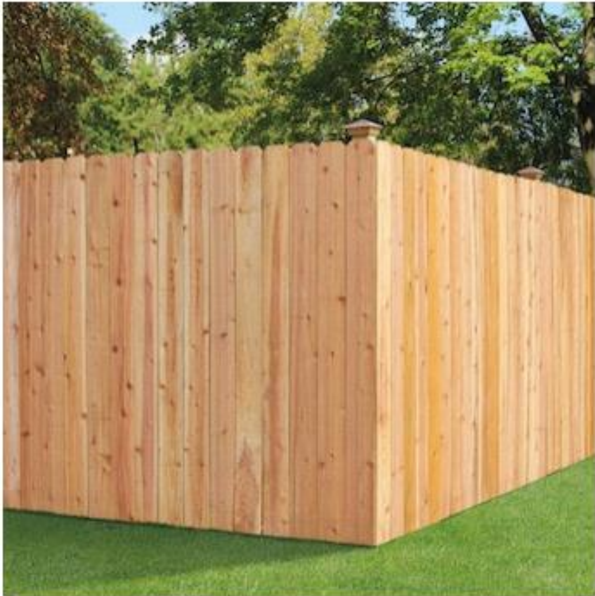
Figure 1 - treated wood fence 8 feet high, 5.5 inch pickets, no picket spacing.