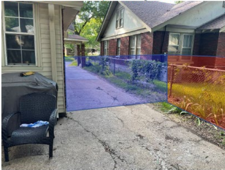
Northeast corner - View of driveway towards Evergreen Street.

Gate (Blue Square) Privacy Fence (Red Square) – Replacing Chain link.