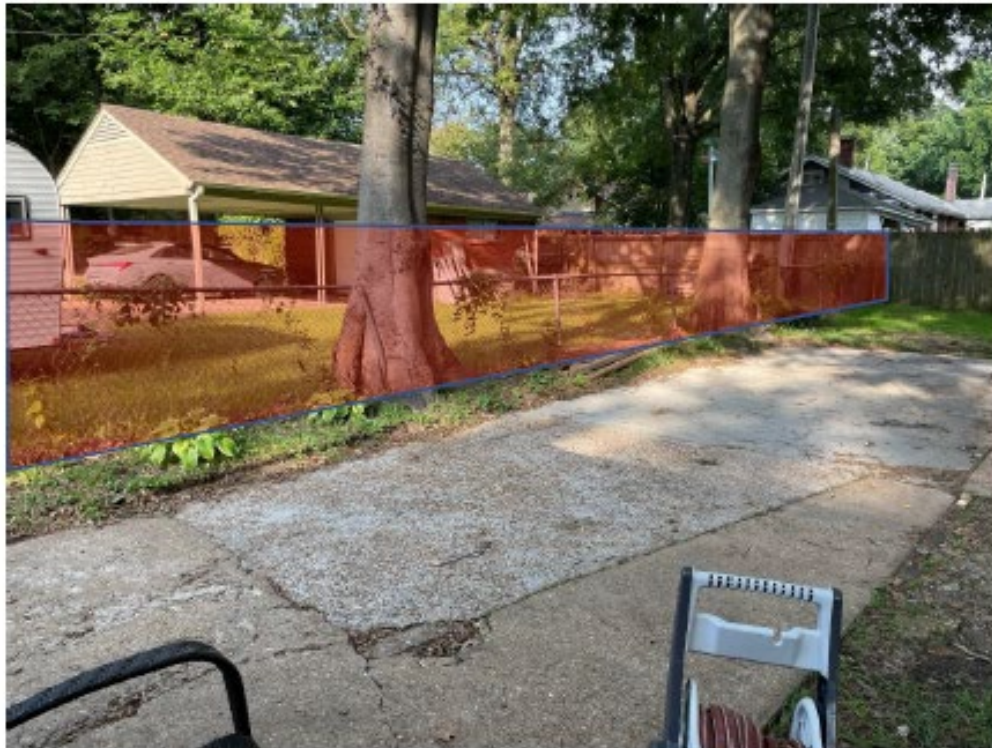
North Fence- Chain link replacement.

Gate (Blue Square) Privacy Fence (Red Square) – Replacing Chain link.