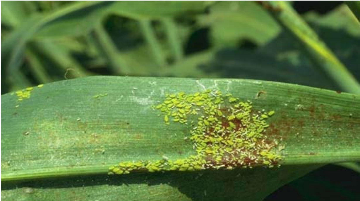
Figure 1. Greenbugs on leaf.